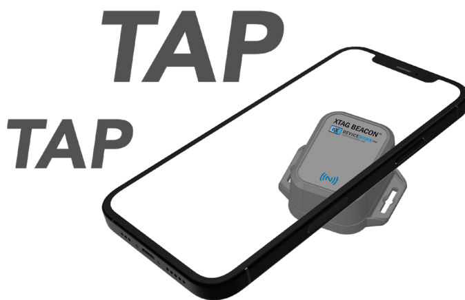
xTAG BEACON Multi-tap Support